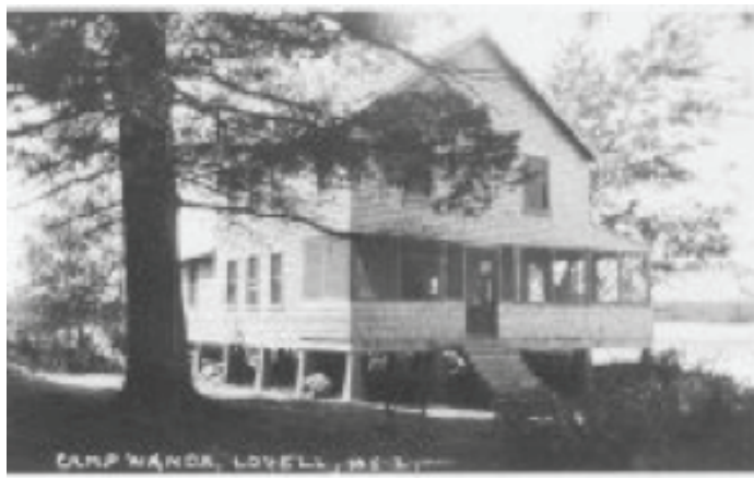
Structure believed to be the original Camp Wanda Director's home.