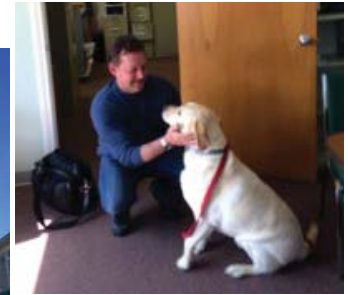
Our first official guests