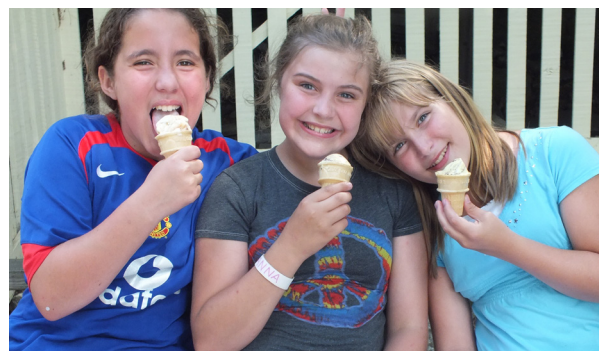
A few of today's campers at Pilgrim Lodge