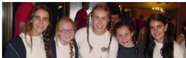
2012 Winners from Tripp Lake Camp

Details to follow. FMI 207-518-9557 or call Bob Strauss, Camp Wigwam (207) 583-2300.