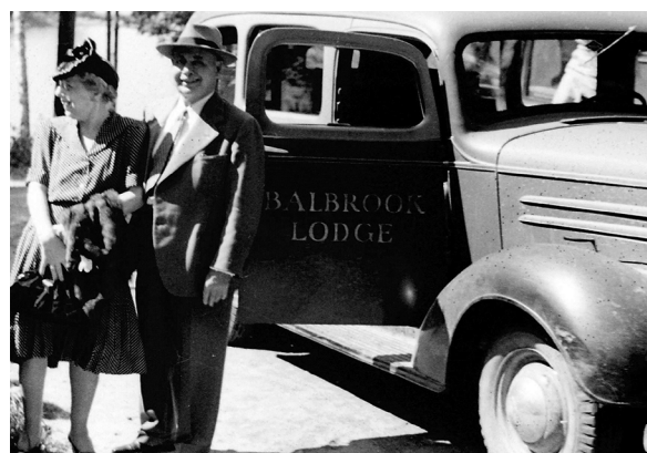
Couple arriving at Balbrook Lodge, circa 1930

"We look to the future eagerly as we are about to launch a long anticipated capital campaign fittingly titled "We Want To Pass It On" evoking the lyrics of a well-loved church camp song. We believe in the work we do and we are honored to be part of the tapestry of camps in Maine that support emotional and spiritual development."