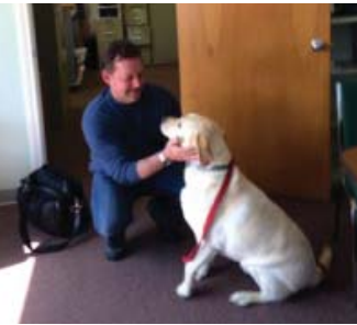
Our first official guests