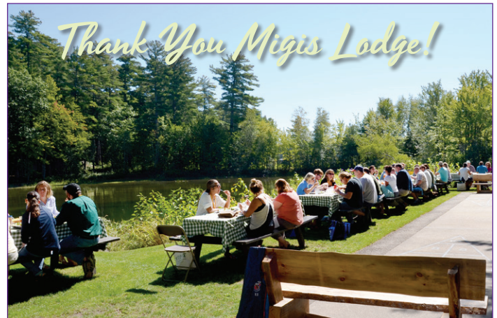
The workshops, facilitated by Education Committee members, included: technology; campers and parents; staff; inspections and accreditation; health; and sex, sexuality and gender.

MSC is gathering notes from each group facilitator, which will be distributed throughout the membership. Click here for notes from September 13 Maine Summer Camps Workshop at Migis Lodge.