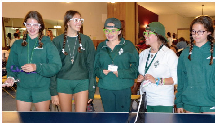
Camp Fernwood came in first in the 13-15 age group.

The outcome for the 13-15 age group resulted in an individual win for Graham, a camper from Wigwam. Camp Fernwood came in first in the group category followed by West End House and Camp Wigwam for third place.