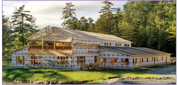
Completely rebuilt Camp Somerset on East Pond will reopen next year and will serve girls ages 8-13.