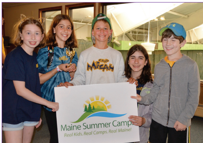
First place in 12-and-under age group was Camp Micah.

On July 13, more than 100 campers from 8 different camps assembled at The Racket and Fitness Center in Portland to compete in the 14th Annual Maine Summer Camps Spelling Bee. Enthusiastic spellers came from as far away as Encore/Coda in Sweden to as close by as West End House in Parsonsfield. All the campers arrived prepared to represent their camp and take home the trophy.